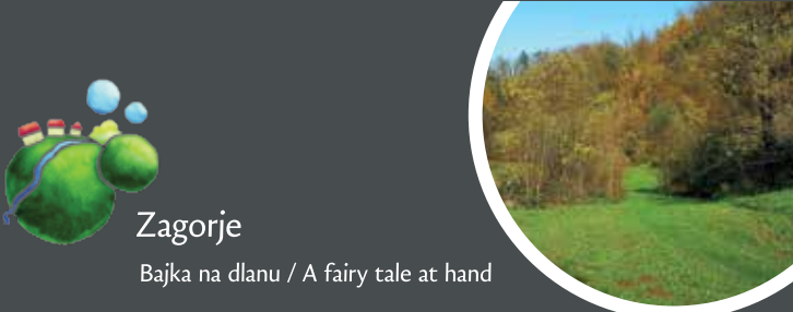
Zagorje Bajka na dlanu / A fairy tale at hand

Muzej Krapinskih neandertalaca / Krapina Neanderthal Museum Šetalište Vilibalda Sluge bb, 49000 Krapina mkn@mhz.hr, www.mkn.mhz.hr +385 49 371 491 Općina Jesenje / Municipality Jesenje Gomje Jesenje 103, 49233 Jesenje http://neandertal-trails.com/neandertal.html +385 91 375 5033 Muzej Radboa / Museum Radboa Radboj 34, 49232 Radboj info@radboa.com, www.radboa.com +385 49 350 118 Javna ustanova za upravljanje zaštitnim dijelovima prirode Krapinsko-zagorske županije / Public institution for management of the protected natural values in the Krapina Zagorje County Radboj 8, 49232 Radboj info@zagorje-priroda.hr, www.zagorje-priroda.hr +385 49 315 060 Center za prirodu Zagorje/Nature Center Zagorje Radboj 34/A, 49232 Radboj info@zagorje-priroda.hr, www.zagorje-priroda.hr +385 49 315 060