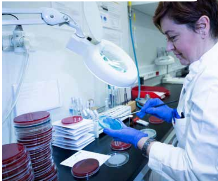
Krapina-Zagorje County Institute of Public Health

Krapina-Zagorje County Institute of Emergency Medicine Dr. Mirka Crkvenca 1 49000 Krapina +385 49 373 411 info@hitna-kzz.hr www.hitna-kzz.hr