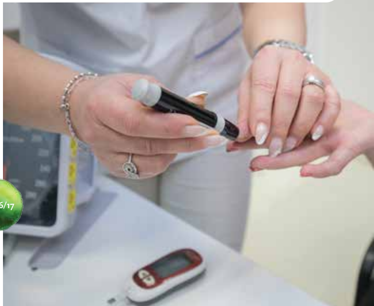
Krapina-Zagorje County Community Health Centre