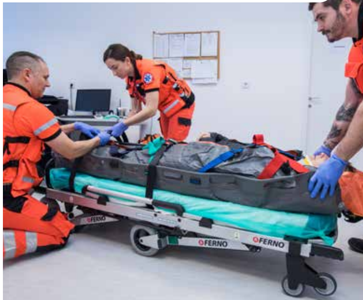
Krapina-Zagorje County Institute of Emergency Medicine

Krapina-Zagorje County Pharmacy M. Gupca 63 49210 Zabok +385 98 237 970 ljekarna-zabok@kr.t-com.hr www.ljekarna-kzz.hr