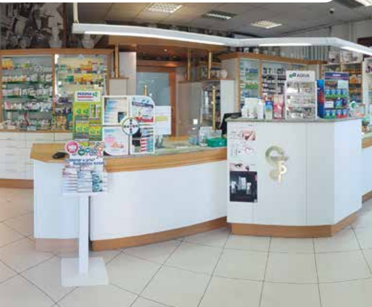
Krapina-Zagorje County Pharmacy

Krapina-Zagorje County Community Health Centre Mirka Crkvenca 1 49000 Krapina +385 49 371 622 info@dzkzz.hr www.dzkzz.hr